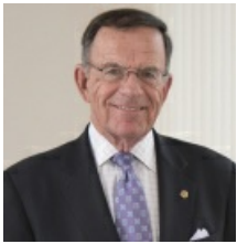
Paul G. Kirk, Jr.